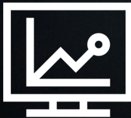
SOCIAL MEDIA MANAGEMENT